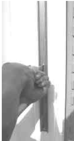
Din Rail Install